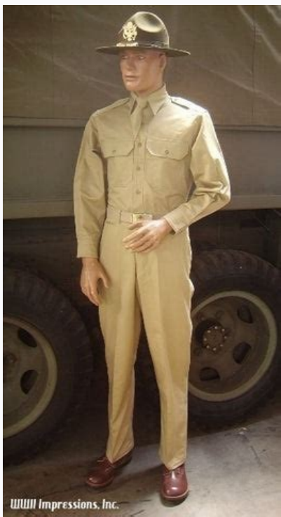
Us army warrant officer dress uniform. Us army chief warrant officer uniform.